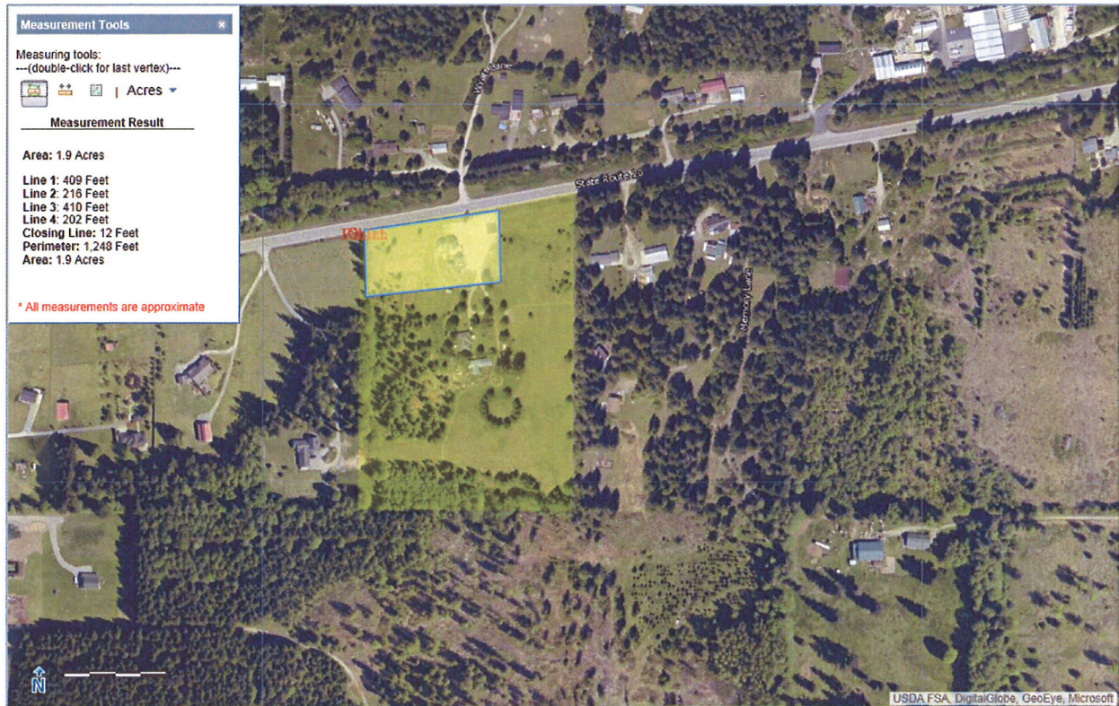
Approximate 2 acre parcel (outlined in blue) of the 12 acre parcel which is recommended for Small Scale Recreation and Tourism (SRT)